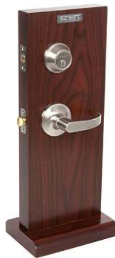
SAN DIEGO (SD)