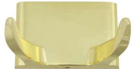
Double Robe Hook US3