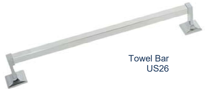
Towel Bar US26