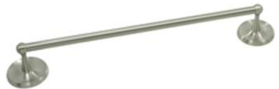
Towel Bar Set US15