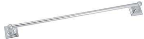
Towel Bar US26