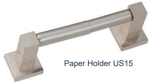
Paper Holder US15