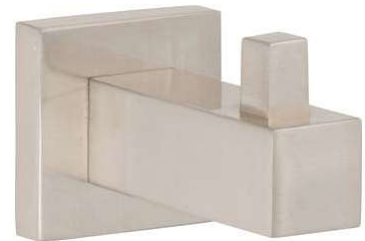
Robe Hook US15